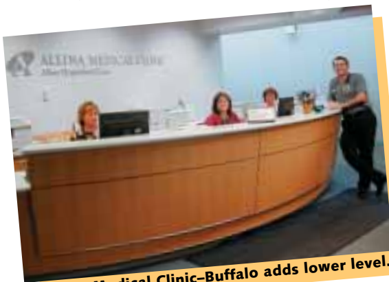
Allina Medical Clinic–Buffalo adds lower level.

2003 Report to the Communities Served by Buffalo Hospital